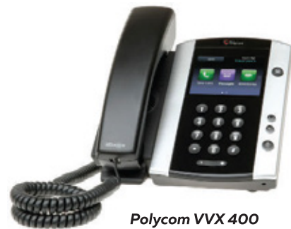
Polycom VVX 400 12 line, color screen – a terrific mid-range device