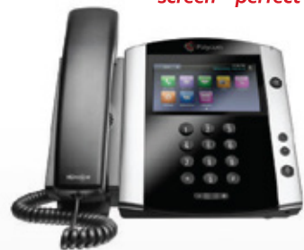
Polycom VVX 500 12 line, with a large color screen – perfect for executives