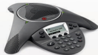
Polycom IP 6000 Premium conference room phone – ideal for mid-sized applications

Range features Polycom IP phones to power your business. Polycom is known industry-wide for its superior voice quality and handset design.